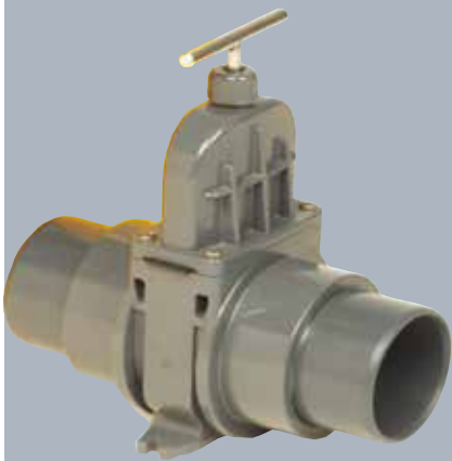
PVC inlet sluice valve DN 100 or DN 150, with pipe sockets bonded in, for the time-saving and space-saving direct connection to the inlet clamping flange.

C ETab by ta 110 the s Tf 0.025 Tw 110 Amping f in. 0226